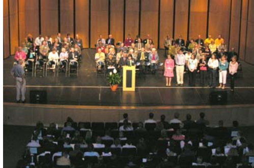
May 2, 2006 Awards Ceremony

Every year after the ceremony, donors leave KNOWING how much they are appreciated .